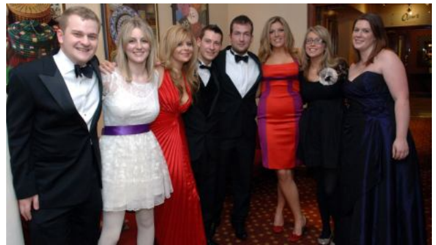
A group of former pupils who left in 2003