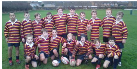
Above: Year 7 Rugby team